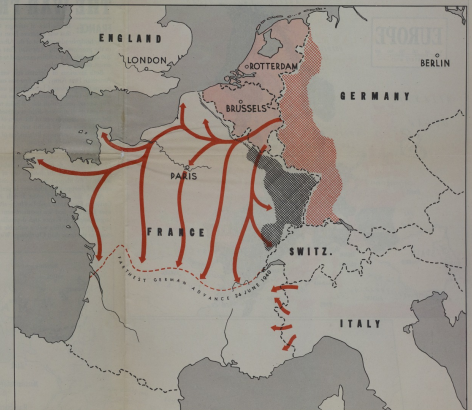
JUNE 1940 miraculous withdrawal from Dunkerque in which 325,000 Allied troops escaped the German trap. At this helpless moment France was attacked from the south by Italy on 10 June. The Germans entered Paris four days later and while some units pressed southward others swung around behind the Maginot Line. By 24 June the fighting was over. The armistice