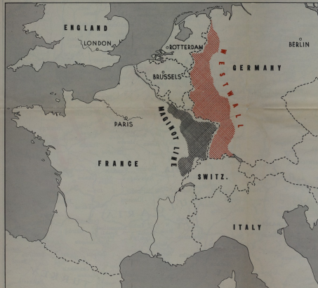
SEPT. 1939 France built her Maginot Line in the ten years before 1939 with the idea that she should never again be invaded by the Germans. Opposite it the Germans threw up the Westwall or Siegfried Line. In the months between September, 1939, and May, 1940, troops in both fortifications maneuvered but contacted each other only in patrols. Nazi troops hit