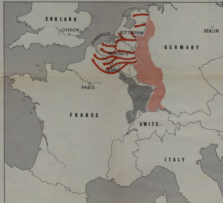
MAY 1940 France at the northwest border after overrunning Poland, Denmark, Norway, the Netherlands and Belgium and struck where the Maginot Line ended and its weaker extension at the boundary of Belgium began. Fast motor columns drove for the Channel and split the Allied forces in two. A week after the Nazis reached the sea 21 May came the