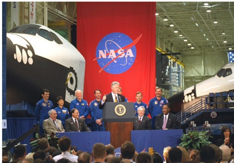
President Clinton speaking at Johnson Space Center

This exhibit covers significant programs or events concerning the National Aeronautics and Space Administration (NASA) during President Clinton's administration. The Clinton administration strongly supported policies and programs designed to cut costs, increase efficiency, spur scientific and technological advancement, and it implemented a series of space policies to address a broad range of civil, national security, and commercial activities.