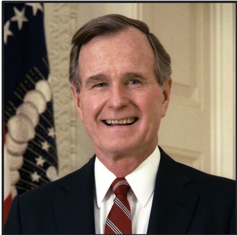
Right: Bill Clinton