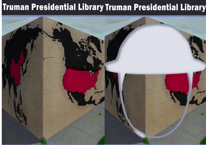
Grand Reopening Summer of 2021 Grand Reopening Summer of 2021 Truman Presidential Library Truman Presidential Library