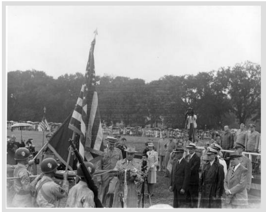
President Harry S. Truman (center) decorating the colors of the Nisei (Japanese-American) 442nd Regimental Combat Team, as other dignitaries look on

NOTE: The President reviewed the 442d Regimental Combat Team and made the presentation in a ceremony on the Ellipse south of the White House grounds at 2:45 p.m.