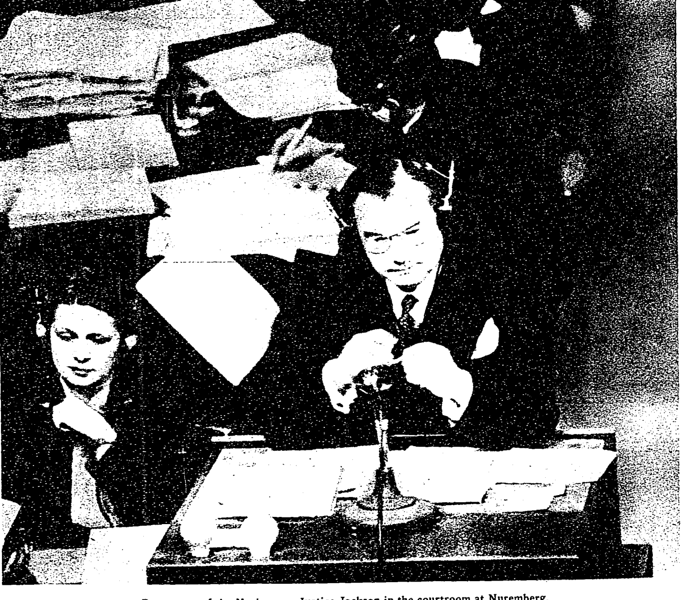
Prosecutor of the Nazi gang-Justice Jackson in the courtroom at Nuremberg.

Counsel have access to their clients and to all witnesses here in Nuremberg. Every document used by the prosecution has been furnished to the defense in German. Every document requested by the defense, if approved by the tribunal as relevant, has been produced by the prosecution if in its possession, (Continued on Page 59)