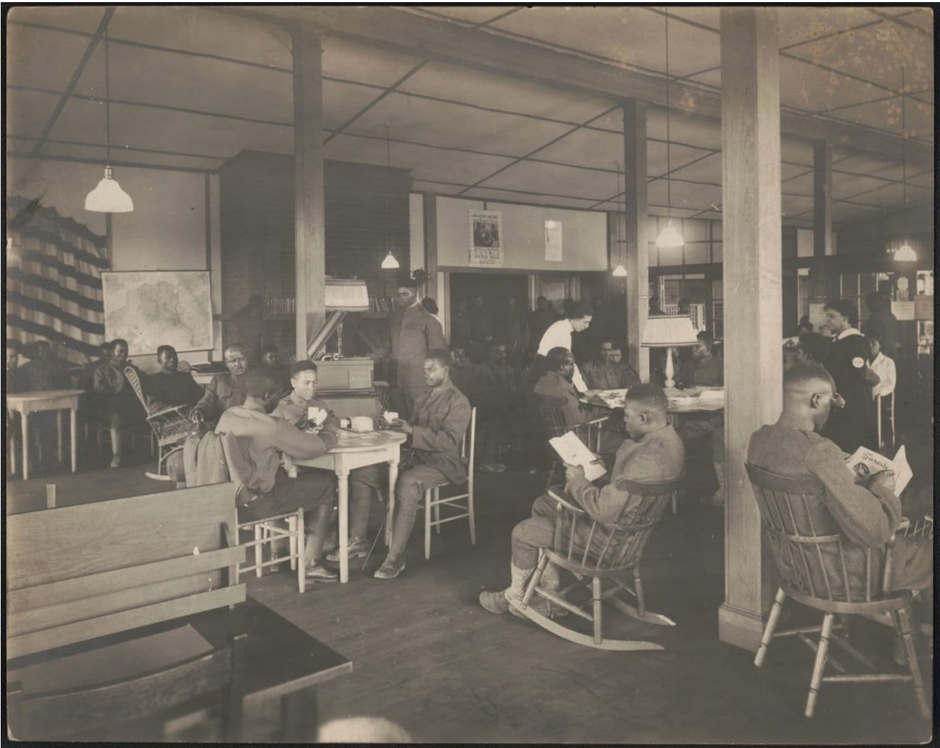
African American soldiers reading and relaxing in a Y.W.C.A. Hostess House in 1918.

By Michael E. Ruane September 22, 2017 – The Washington Post