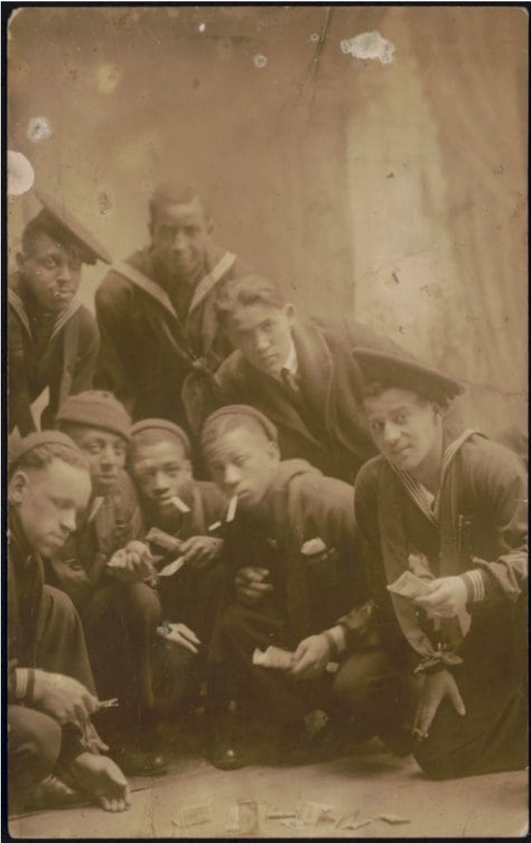
Unidentified African American sailors playing a betting game.

There are elegant individual portraits and group shots. There are soldiers and sailors — the latter, in one picture, apparently engaged in some gambling enterprise.